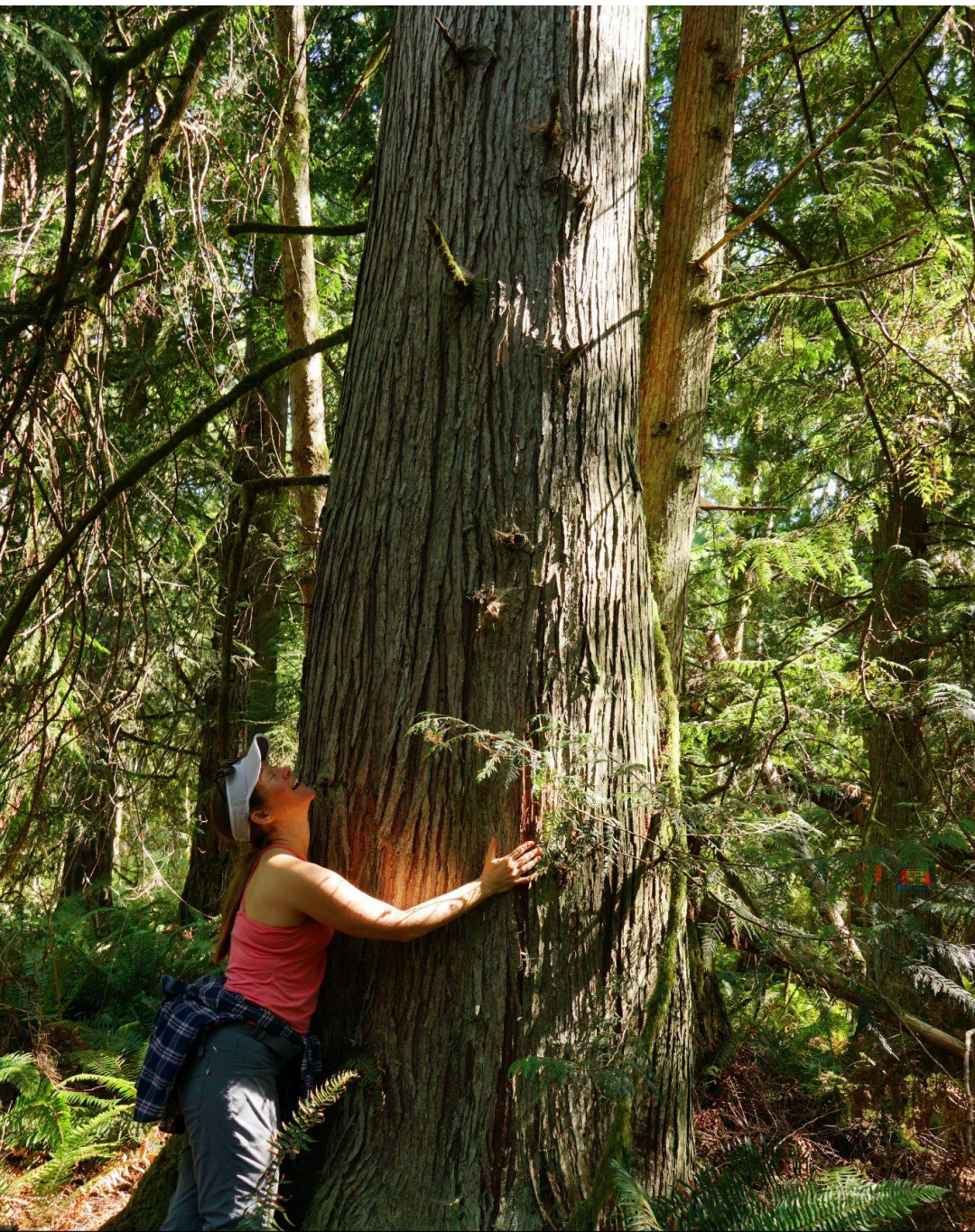
“H” large cedar 47°55'15.09"N 122°52'17.85"W