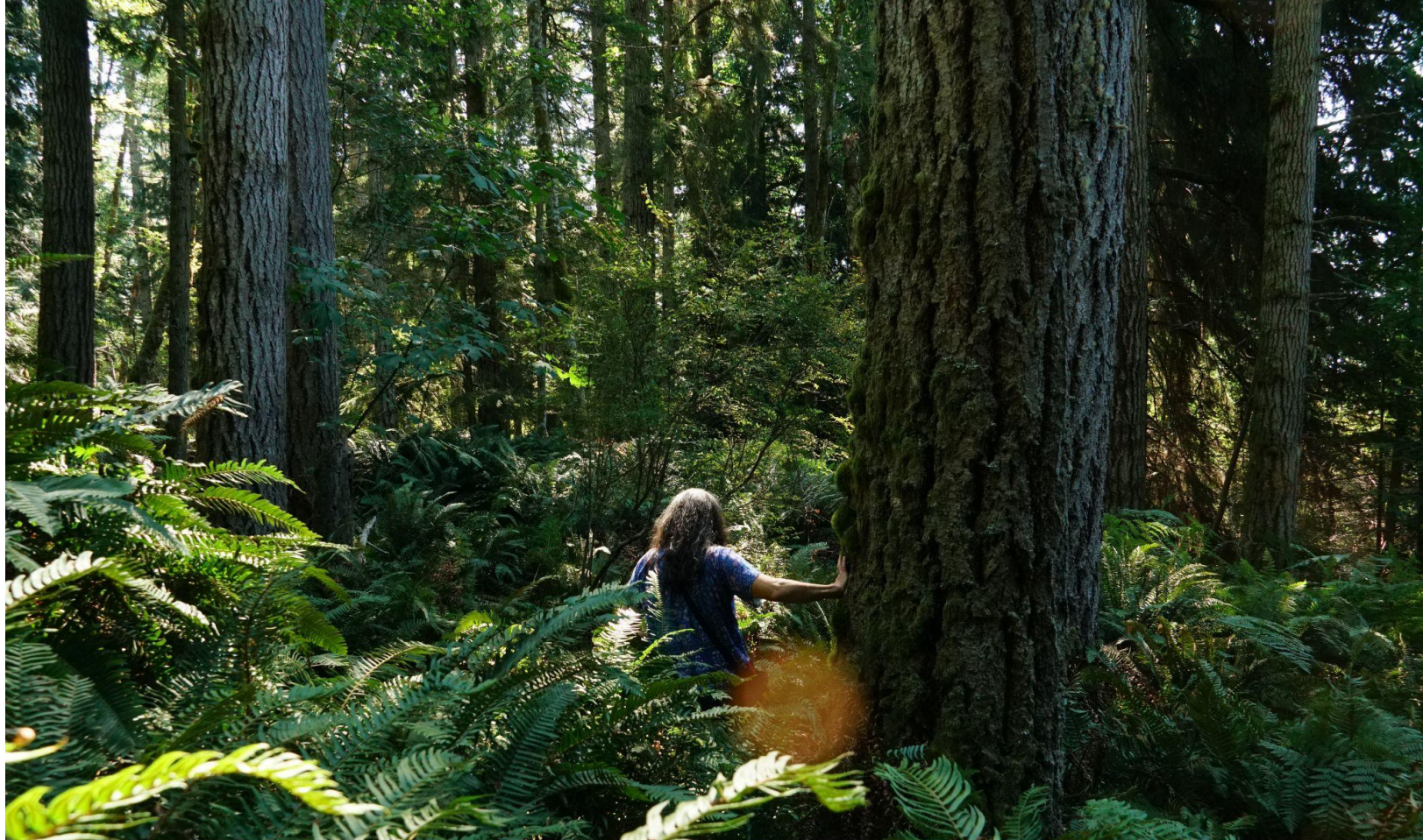
“B” large trees and understory (47°54'53.38"N 122°52'1.54"W)