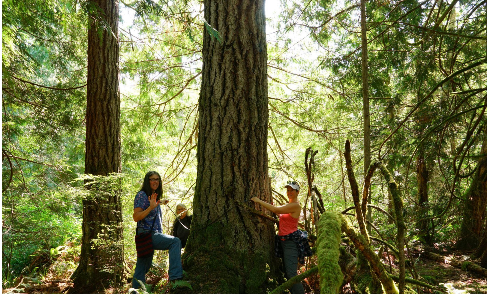
“J” large Douglas Fir (47°55'12.29"N 122°52'18.05"W)