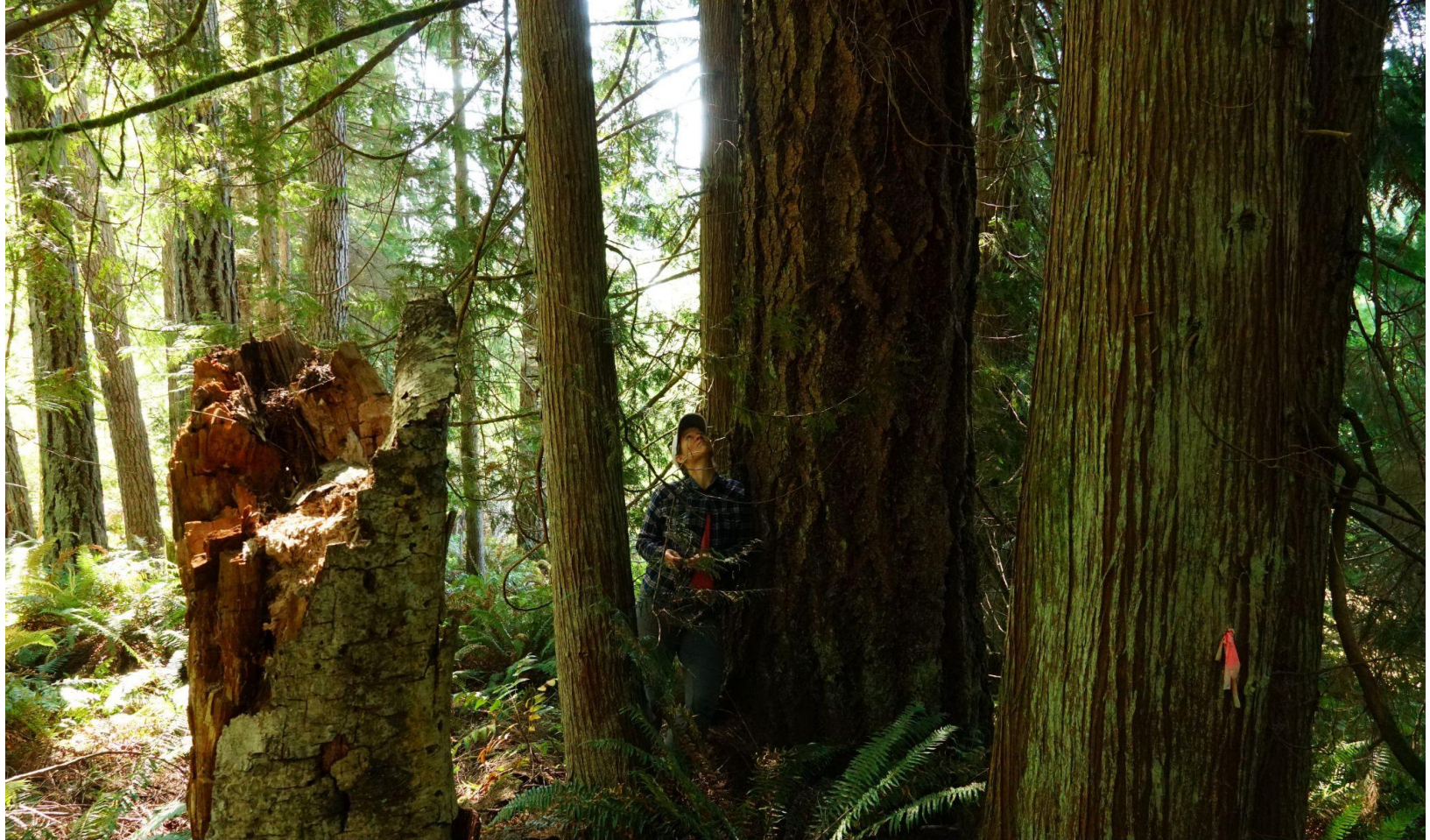
"A" large trees and deadwood (47°54'50.76"N 122°52'1.36"W)