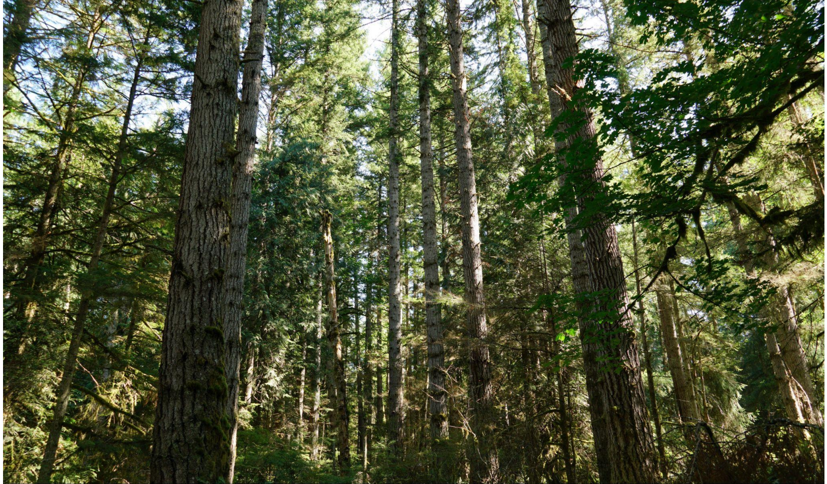
“D” canopy (47°55'23.53"N 122°52'16.36"W)