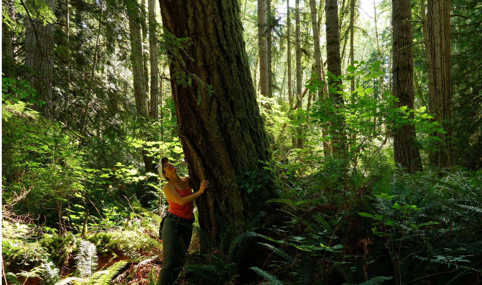
“F” large tree and canopy (47°55'22.81"N 122°52'18.47"W)