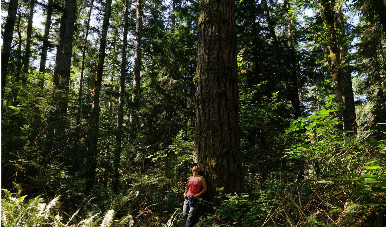
“E” large tree (47°55'22.69"N 122°52'17.37"W)