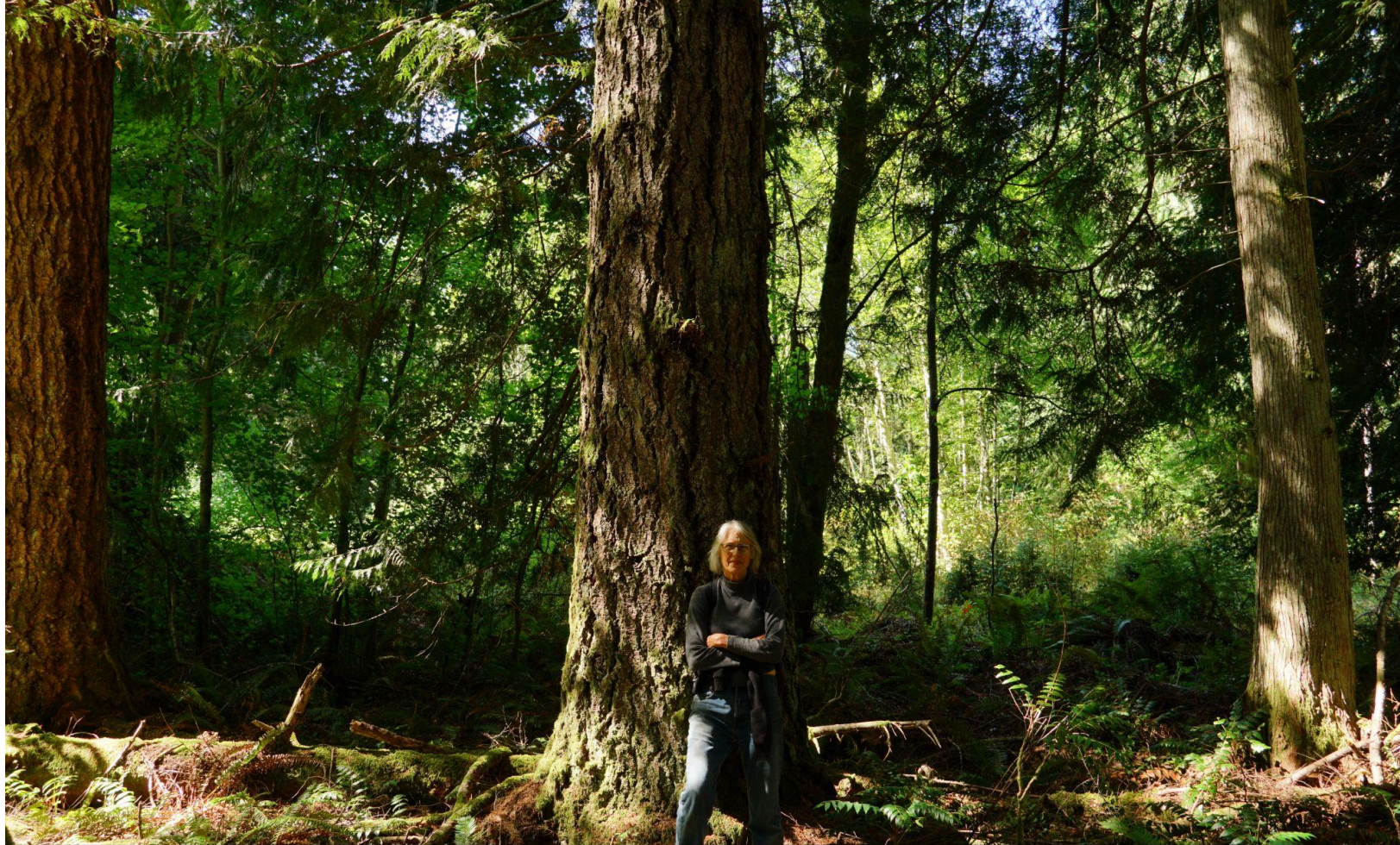
“I” large Douglas Fir ( 47^{\circ}55'13.68''\text{N} 122^{\circ}52'18.15''\text{W} )