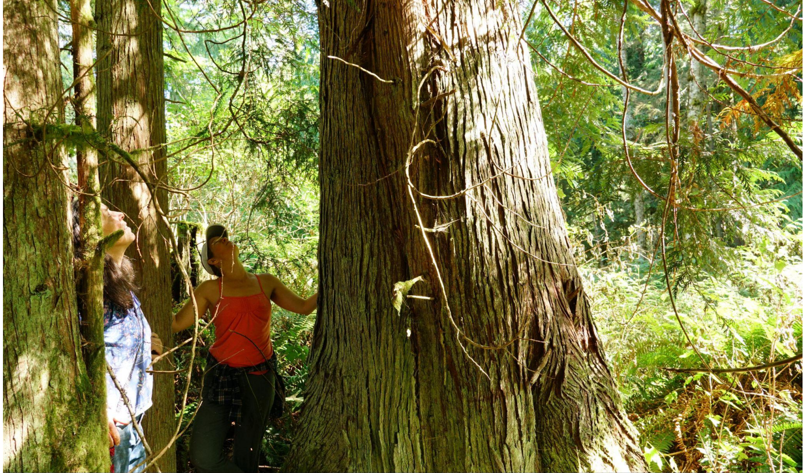
“G” large cedar (47°55'14.98"N 122°52'19.95"W)