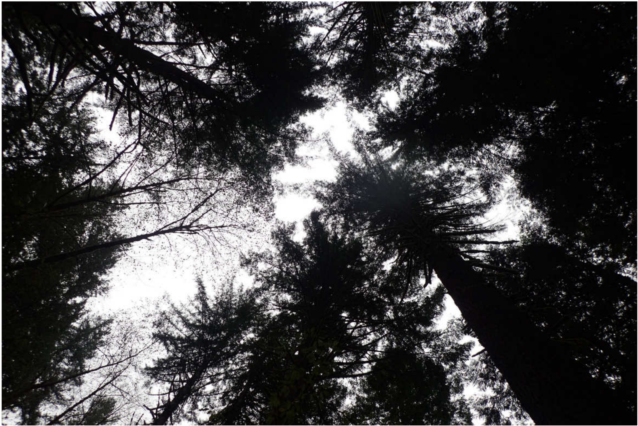
View of Canopy Illustrates Structural and Tree Species Diversity (Unit 1)