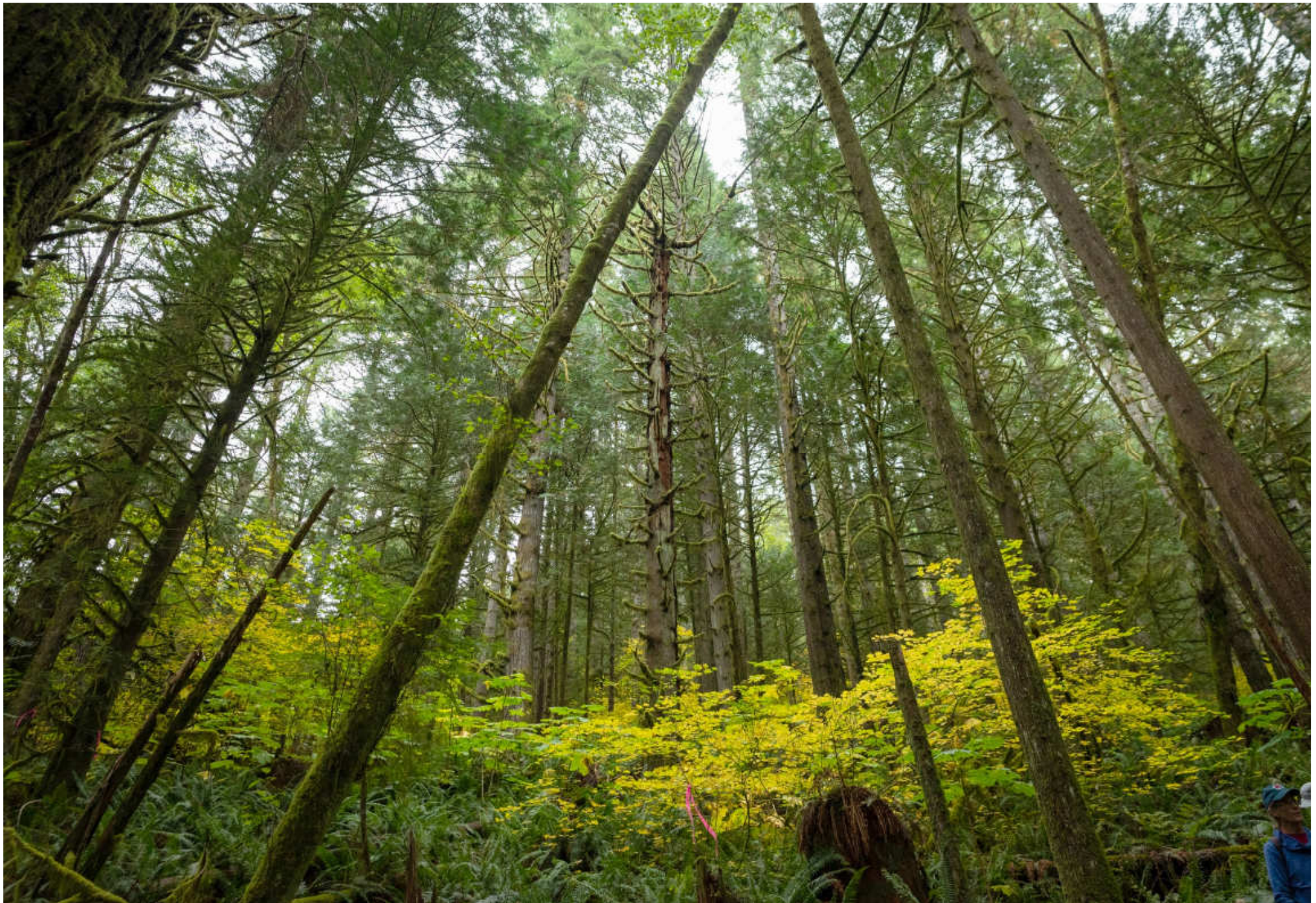
Example of Understory Development / Plant Species Diversity (Unit 1)