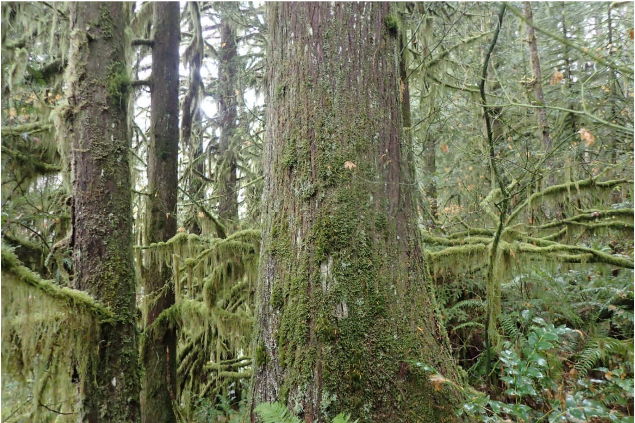
Large Cedar Tree: Carrot Unit 1