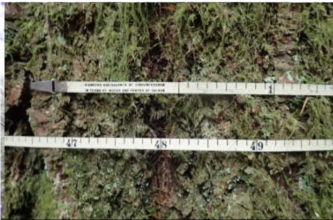
48 Inch Diameter Douglas Fir Tree