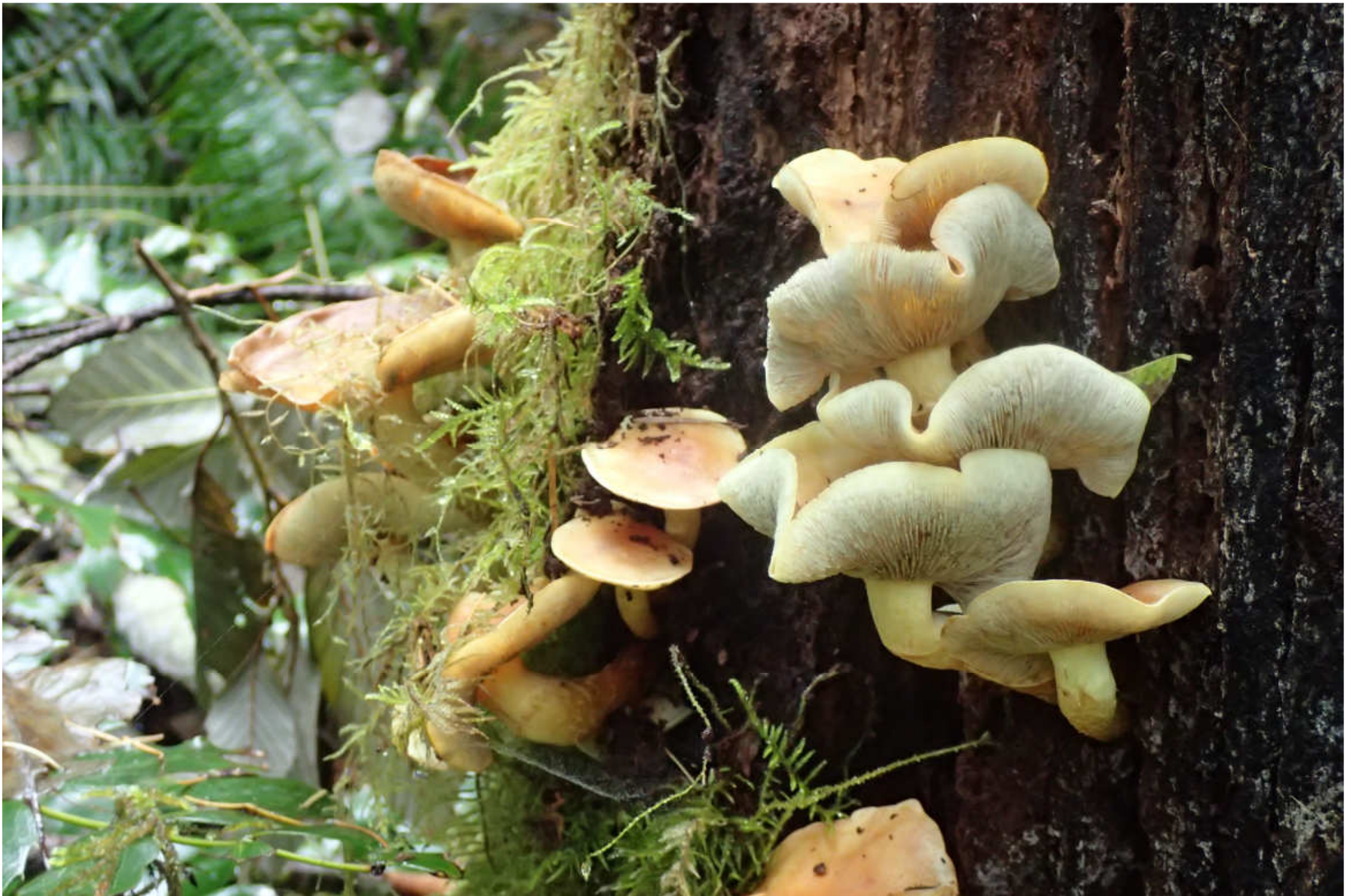
Mushrooms Growing on a Large Snag