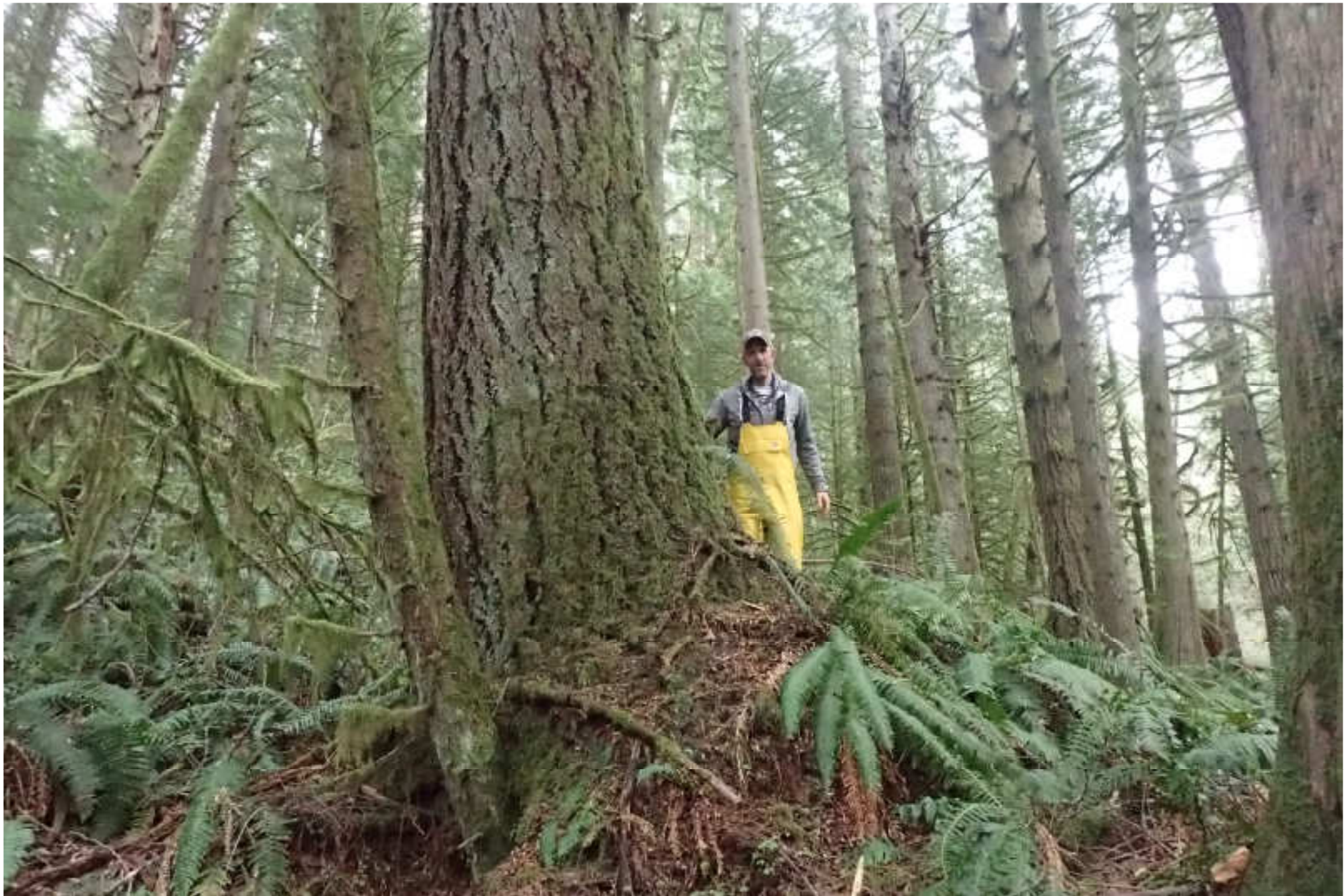
Large 4-foot diameter Douglas Fir Tree (Unit 1)